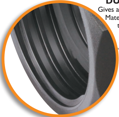
ACME Thread IBC Tank Fitting

Gives a Strong Reliable Seal. Material is strong enough to minimise potential cross threading