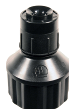
Spectrum™ Thread 1/2" Female