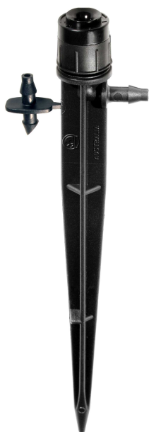
Spectrum™ Spike Inlet 4 mm