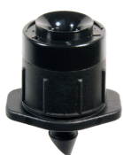
Spectrum™ Barb 4 mm