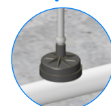
CONNECTION TO PC ONLINE DRIPPER