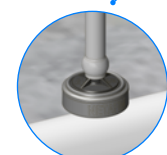
CONNECTION TO PCJ ONLINE DRIPPER