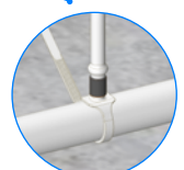
CONNECTION TO UNIRAM™