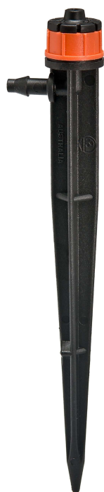
Shrubbler® 360° PC Spike with 0.16" Inlet