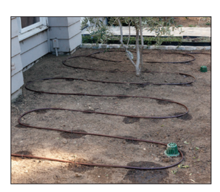
Techline dripline placed in flower beds, on top of the ground, ready to be covered with mulch.