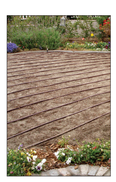
Techline dripline subsurface installation prior to laying sod.