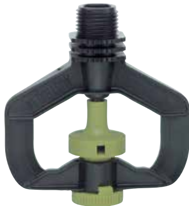
Inverted Rotor Max™