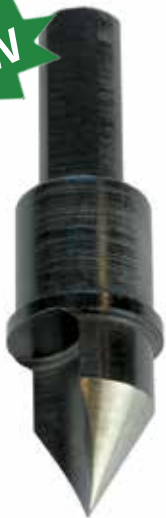
Xpando® Drill Bit