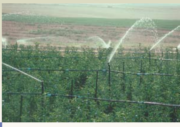
Permanent Set . Overhead irrigation for cooling.

Solid Set . Aluminum pipe, PVC, or Polyethylene.