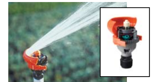
Road Guard (#9879) The R2000WF Rotator can be converted into a partcircle sprinkler.

Threaded Cap (Shut Off) for Acme Adapters (#10615)