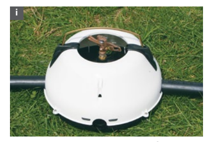
Flush the irrigation line prior to fitting the pipeline Tow Eye to remove any drilling debris left in the pipe.