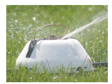
Irripod Plus High Visability Pod