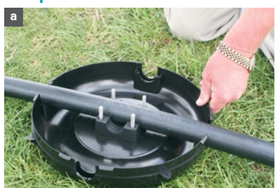
Lay pipe over Skid Base and secure in position with Cross Tee Anchor.