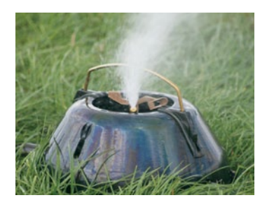
Irripod DIY Black Pod