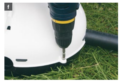
Secure top body by screws around the base.