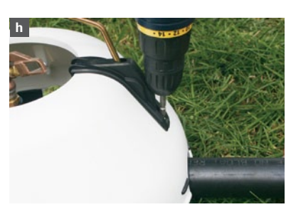
Screw wire clip holders into the holes provided.