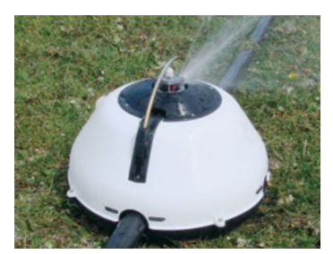
Irripod Pop-Up Pod