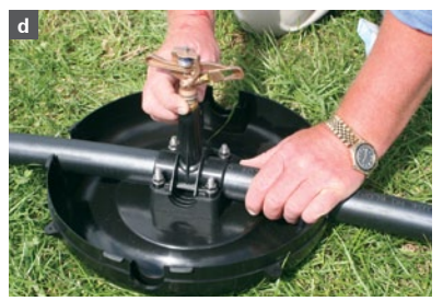
Screw sprinkler into sprinkler riser.