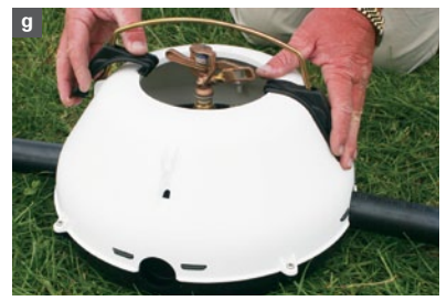
Fix wire clip into opposing holes on body sides.