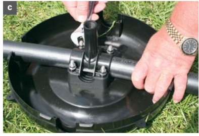
Select the Riser to suit your sprinkler size. Ensure fastening nuts are tightened evenly. Fit O-ring seal to sprinkler riser, locate riser spigot into hole in pipe and fasten the cross tee anchor.