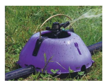
Irripod Lilac Effluent System