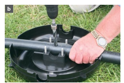
Drill 15mm (9/16") hole at required spacing for the sprinkler type being used and remove all drilling swarf. Ensure the hole is drilled perpendicular to the Pod Base.