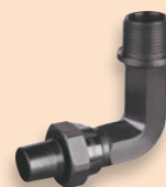
Male Bend Long - HMBL