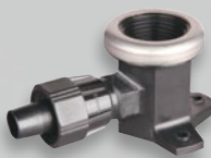
Reducing Bracket Elbow - HRBE