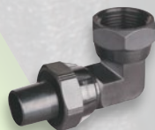
Female Bend - HFB