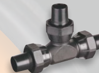
Tee Connector - HT