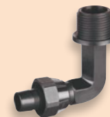
Reducing Male Bend (Long) - HRMBL