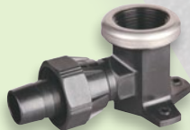
Bracket Elbow - HBE