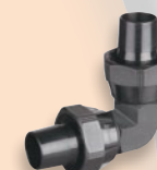
Bend - HB