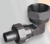
Reducing Female Bend - HRFB