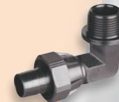
Male Bend Short - HMBS